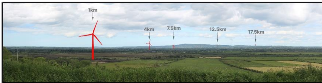
Figure 1-1: Effect of Distance on the Visibility of Wind Turbines (illustrative purposes only).